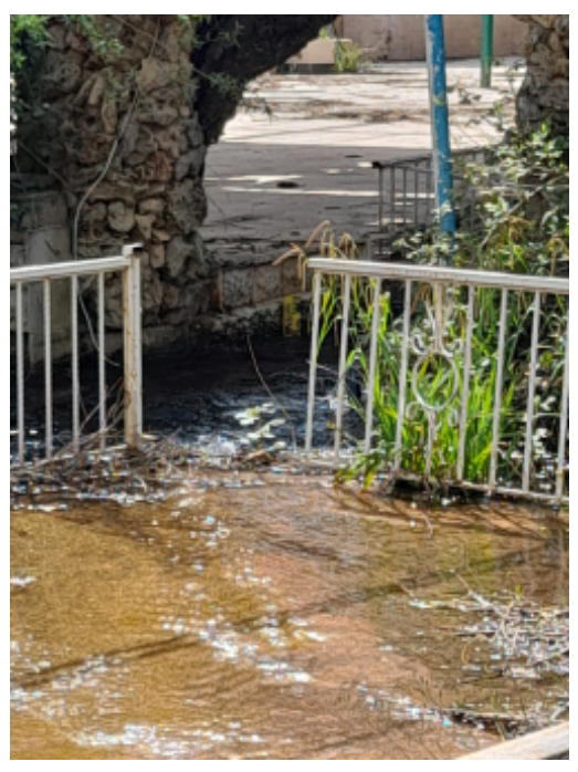
AZ river measurements.jpg