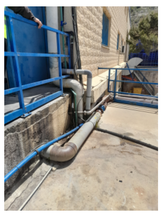
AZ waste water factory exit.jpg