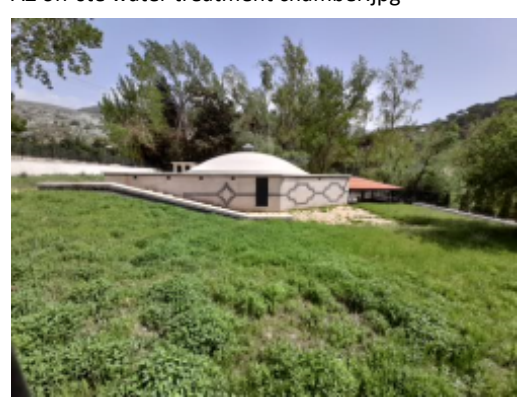
AZ Barouk spring house.jpg