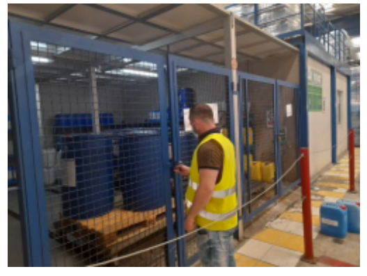
AZ Chemical storage.jpg