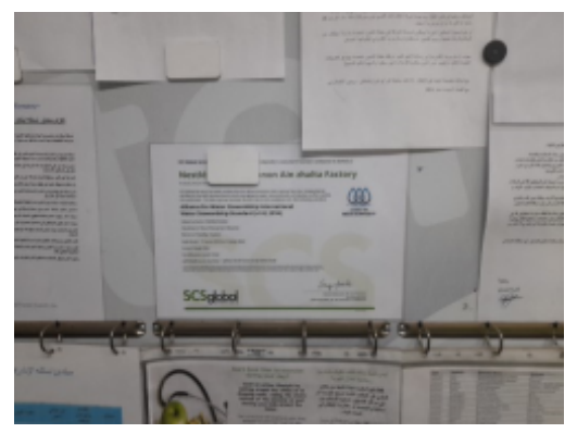
AZ AWS Certificate.jpg