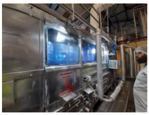
AZ 19I bottle cleaning.jpg