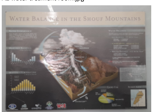
Shouf Catchment water balance.jpg