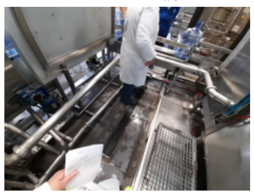
AZ Production water drainage.jpg