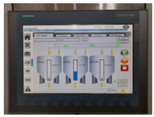
AZ water treament room 2.jpg