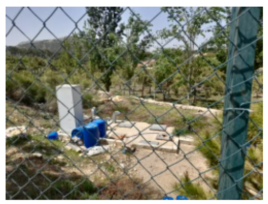
AZ off-ste water treatment chamber.jpg