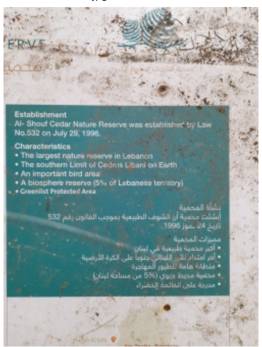
AZ Al Shouf CedAR Nature Reserve.jpg