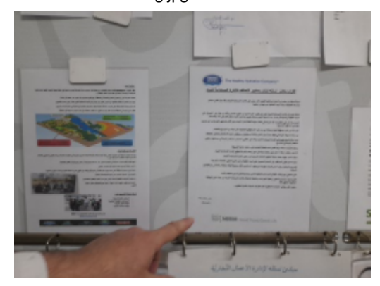
2.1.1 AWS commitment in Arabic.jpg