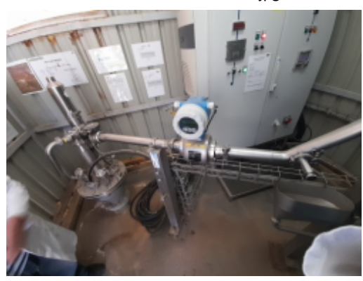
AX decommisioned on-site well.jpg