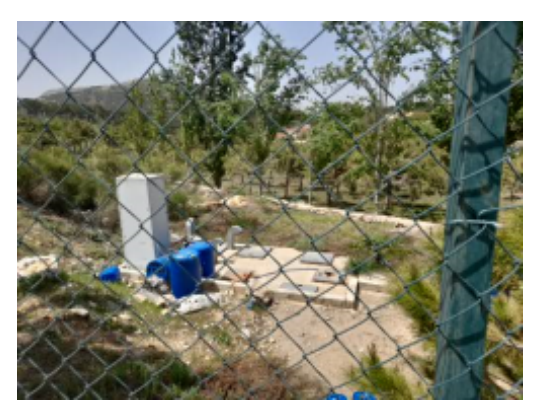
AZ off-ste water treatment chamber.jpg