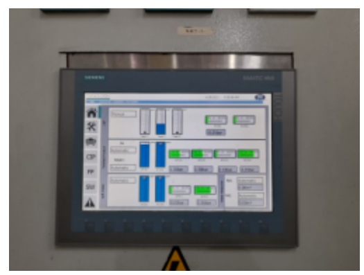
AZ water treament room.jpg

Comment Please find a range of pictures attached, that were taken during the audit.